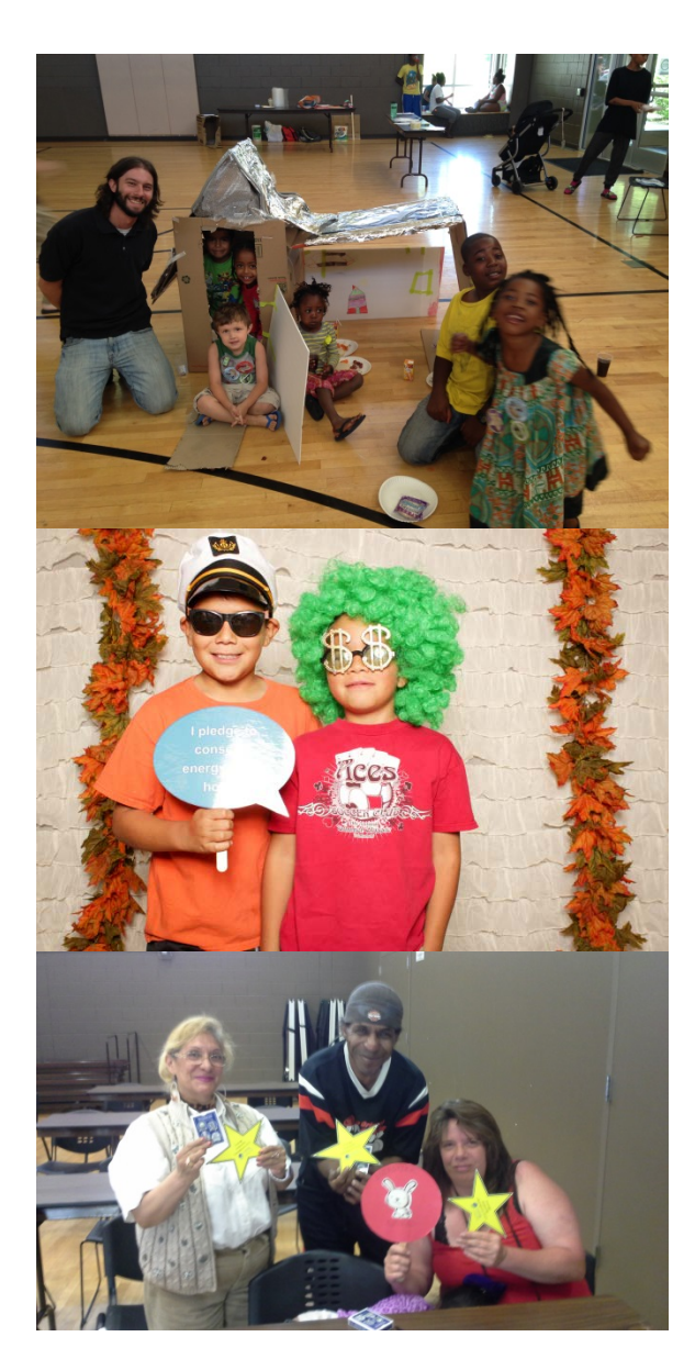
Energy Outreach Colorado's robust resident engagement program helps tenants understand their energy use.

Next Steps: Lower natural gas prices and higher construction and retrofit costs in the area may mean that multifamily efficiency projects will have a tougher time passing utility cost-