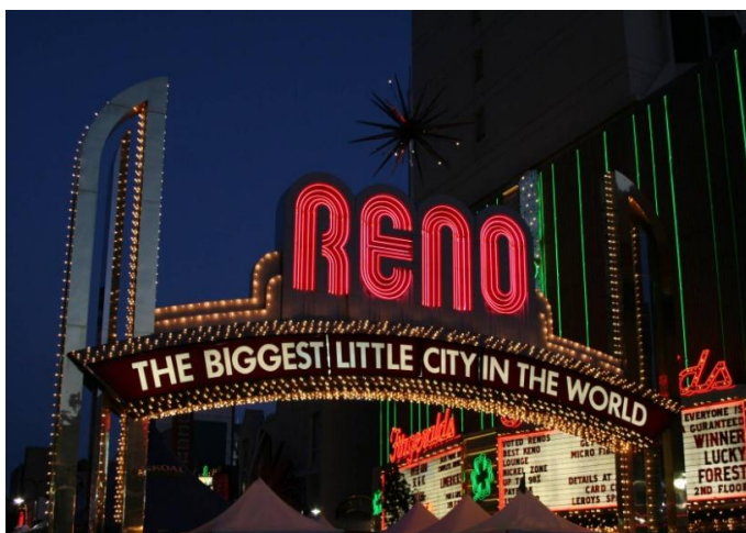
Energy-efficient LED bulbs light up the Reno Arch.

In June and September of 2009, the City Council approved a series of Phase I and II projects which involved solar photovoltaic (PV) systems, small wind turbines, solar thermal heating systems, lighting retrofits, control systems, and a variety of HVAC upgrades. For Phase III the City contracted with a local solar company to install and operate eight new solar systems with a total of 1 MW generating capacity. In February 2010, the Nevada State Office of Energy (NSOE) started a streetlight retrofit program with ARRA funds. Among other projects,