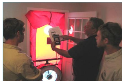
ECC members receive training on how to conduct an energy audit. Both members pictured were hired by local companies.

The City of Flagstaff partnered with Energy Conservation Corps (ECC), a project of the Coconino Rural Environment Corps (CREC), to implement the Energy Retrofit Program as a public-private partnership that facilitates apprenticeship-style opportunities in the building science and performance industry. ECC crew members work alongside practicing building science professionals and contractors throughout the implementation of building retrofit services, gaining valuable skills which could lead to careers in energy efficiency and green building. ECC members also receive AmeriCorps Education Awards for use in pursuing post secondary education including energy efficiency certification programs.