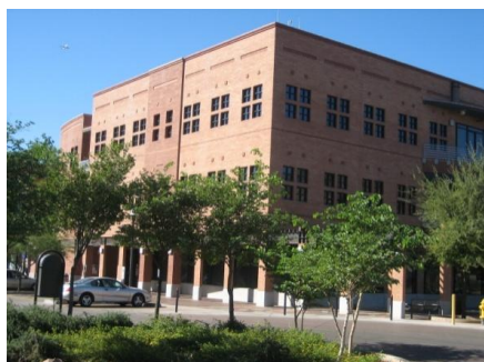
City of Tempe office building

While equipment retrofits provided the bulk of energy savings, significant savings resulted from energy conservation policy and behavioral changes in operations and maintenance procedures. These changes were effectively implemented across the board in approximately one hundred city buildings.