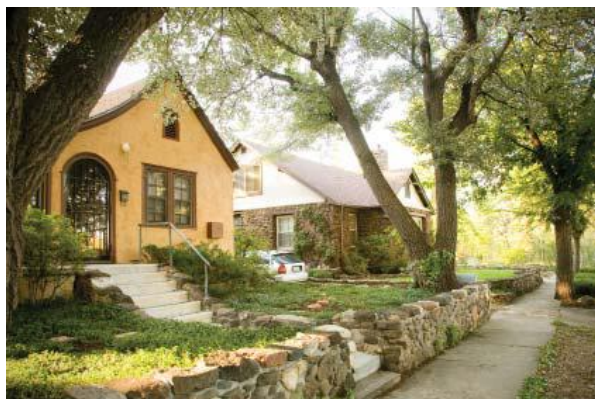
Flagstaff home retrofitted for energy efficiency

Supported by the City's ongoing commitment to energy efficiency, this program demonstrates a model for sustainable community action through on-going reductions in energy consumption and greenhouse gas emissions, while also promoting affordable living. Due to regional economic conditions, Flagstaff residents often lack fiscal resources that would spur investment in home energy efficiency improvements. Residential energy retrofits are complemented by job creation, workforce development, and a community-based educational model that prioritizes energy performance and individualized behavioral change education.