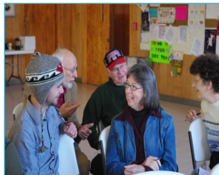
Flagstaff community members participate in a Weatherization Clinic.

Estimated savings are based on the energy auditor's report and retrofit measures installed. Before and after tracking is conducted on a monthly and accumulated basis to document energy, greenhouse gas, and cost savings resulting from energy retrofits. Savings realized during the first year of the program are influenced by total program participation and the date the energy retrofits were performed. The 165 energy retrofits performed during the program's first year result in an estimated annual savings of 592,603 kilowatt hours (kWh) and 912,608 pounds of carbon dioxide equivalent (CO 2 e). At the one-year benchmark, the