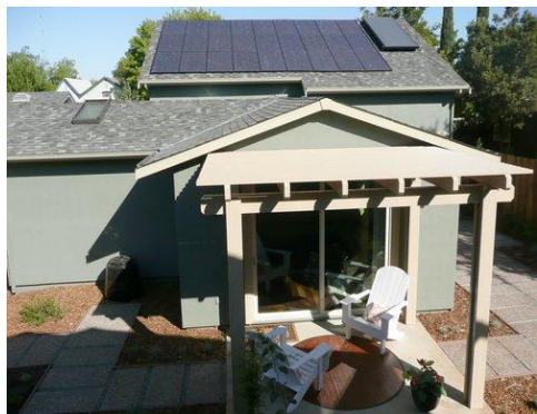
New homes like this one built under the 2009 IECC include many energy-saving features.

Although city staff members were knowledgeable about energy codes, they requested assistance from the DOE Technical Assistance Center (TAC) so they could learn about the best construction practices for compliance with the code in their climate zone. Through TAC, the Southwest Energy Efficiency Project (SWEET) assisted the City in developing a strategic outreach plan for implementation of the energy code. Challenges included limited knowledge of compliance techniques by builders and contractors; the higher cost of building to a state-of-the-art energy code; and changes to common construction methods. The staff's goal was to convince policy makers and stakeholders that compliance with the energy code is beneficial, achievable, and cost effective.