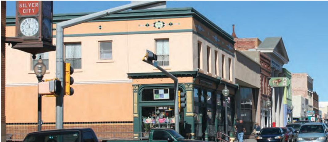
Historic downtown Silver City

BRIEF DESCRIPTION: Silver City and Grant County are closely tied to the copper mining industry, which has been impacted by downturns in the economy. These small communities received two Energy Efficiency and Conservation Block Grants (EECBG) and created a Joint Office of Sustainability with a broad goal of fostering a greater degree of community self-reliance through residential energy conservation, efficiency and large-scale renewable energy projects, as well as encouraging new green jobs, businesses, and economic development for the region.