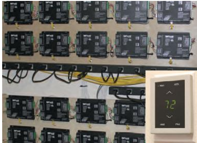
The array of 27 sensors that send thermostat information to the web-based tracking program (Inset: Zone thermostat that sends data to the sensors)

The entire system uses electricity, eliminating natural gas costs. Each of the 16 heat pumps is located near its distribution zone. A central computer regulates the 27 thermostats installed in each zone. City staff in each thermostat zone can choose their own level of comfort. The system automatically drops the temperature to 69 degrees after regular business hours, even if people forget to lower the thermostat at the end of the day. Duran especially likes the new smart system's ability to monitor units in real time. All of the data on heating, cooling, and energy consumption are available at his desktop computer.