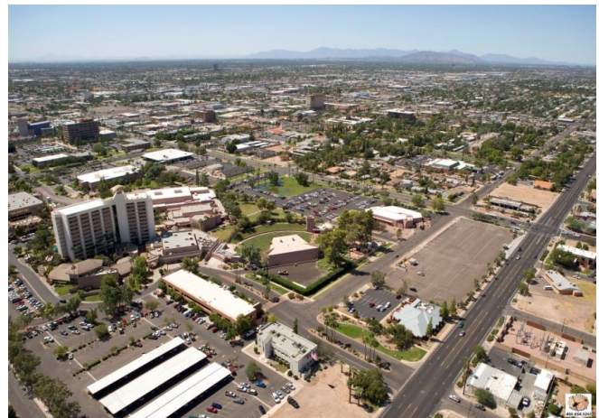
Panoramic view of Mesa, Arizona

The City of Mesa, Arizona is home to approximately 440,000 residents, making it the third most populous city in the state. In 2010, the City initiated a project to evaluate the adoption of an energy code as a means to improve the energy efficiency and indoor environment of its buildings and deliver significant energy bill savings for residents and businesses. Because Mesa had never before adopted an energy code, it recognized that community input was essential, especially from the building industry. To that end, Mesa developed a strategic roadmap for adoption of an energy code that included extensive research and stakeholder outreach. The goal was to fully understand how the adoption of an energy code citywide would impact Mesa's building industry, residents and businesses, and to determine which energy code would provide the most cost-effective energy savings.