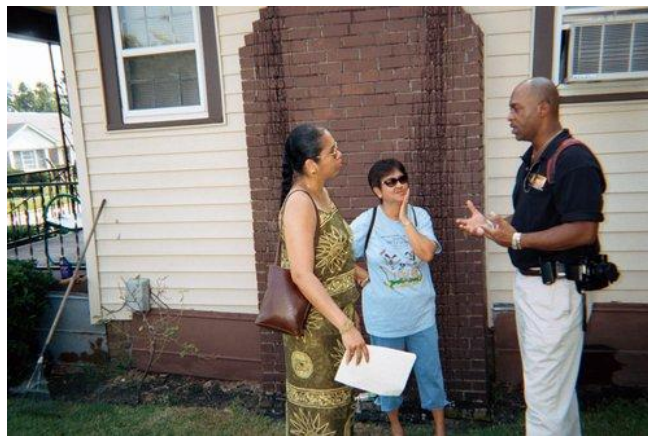
Energy Concierge/Advisor Service

Upon contacting the EnergySmart call center, homeowners are assigned an Energy Advisor who immediately establishes personal contact and visits the home to provide energy efficiency solutions. As a first step the Advisor installs efficient light bulbs, water saving showerheads and faucet aerators, insulation for water pipes and performs basic air sealing. The Advisor then connects homeowners with an Efficiency Specialist to perform an energy audit and create an EnergySmart Recommendations Report suggesting upgrades specific to the property.