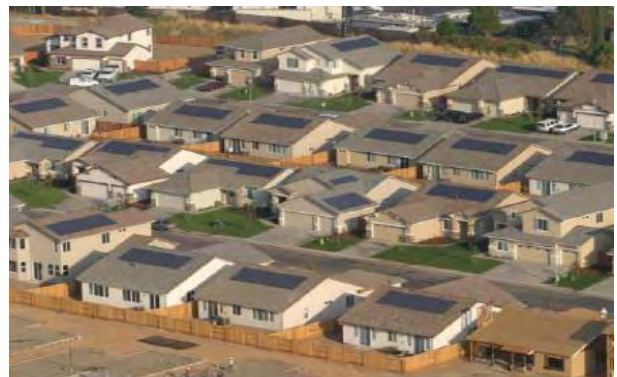
Figure ES-1. Photo of zero energy homes at Premier Gardens, Sacramento, CO

Since 2001, the Sacramento Municipal Utility District (SMUD) has sponsored several ZEH projects within its service territory through partnerships with the DOE Building America program. In 2007, SMUD initiated the ‘SolarSmart New Homes’ program, in which SMUD is partnering with builders to achieve up to 60% savings in electricity costs, and peak electricity demand reductions of up to 65% in new homes (BIRA 2006 and US DOE 2006). The SMUD