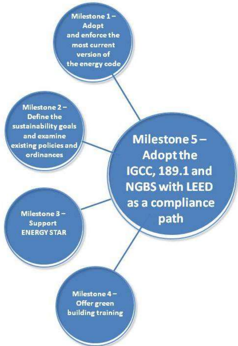
Figure 2. Milestones

The specific recommendations presented in this chapter were created by the stakeholder group to provide jurisdictions with clearly defined incremental steps – presented as milestones, tools and resources – to support implementation of a regionally consistent local green building program (Figure 2).