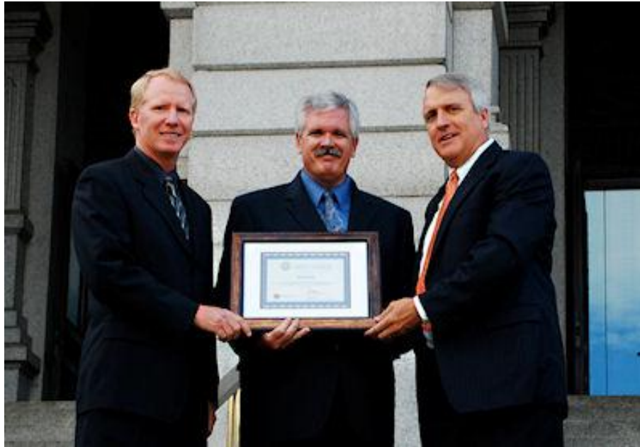
Figure 2. First CIEC Recognition Event

In July 2010, Colorado Governor Bill Ritter (right) presented a certificate of recognition to representatives of Amgen (left and middle) as well as to the other thirteen charter members of the Colorado Industrial Energy Challenge. The governor thanked the companies for their commitment to energy efficiency and encouraged further action. Having the Governor's support of the program has been crucial for gaining buy-in and participation.